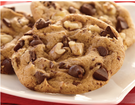
709 Walnut Chocolate Chip