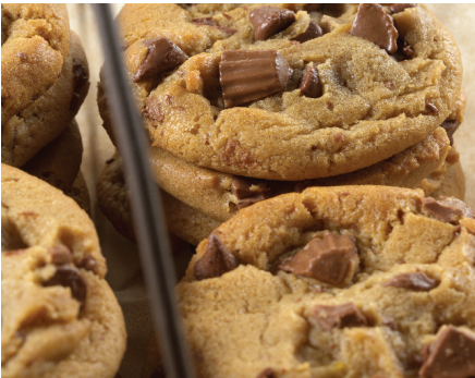
703 Peanut Butter Cup Chocolate Chip