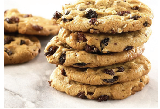
707 Oatmeal Raisin