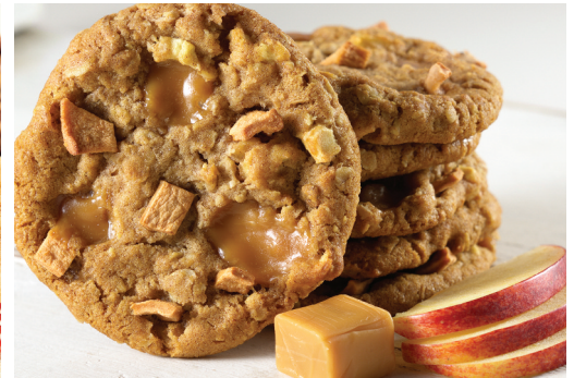
706 Caramel Apple Crunch