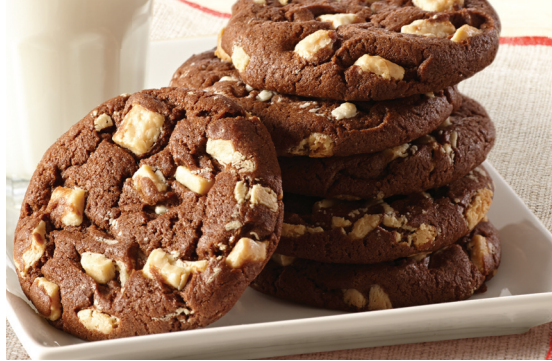
708 Double Chocolate With White Chunk