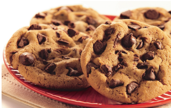
701 Chocolate Chip